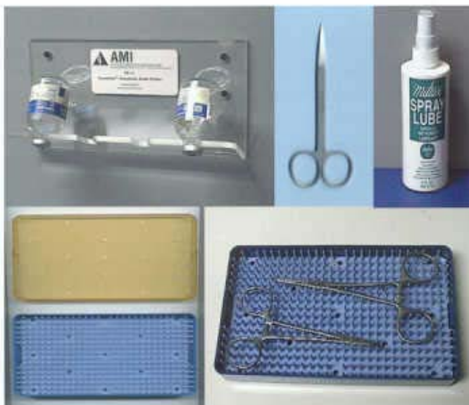
Clockwise from top: VE-11 Handzfree™ Anesthetic Bottle Holder, VE-4 Iris Scissors, VE-5 Instrument Lubricant, AC-7540 Case with NSV Instruments