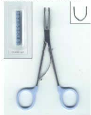
VE-6 Applicators & VE-6-25 Clips (Insets)

More and more physicians rely on multiple occlusion methods during vasectomy. The reasons for this trend are unclear, but concerns over liability in case of failure have probably played a role.